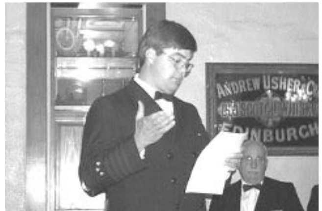
And here's what we're gonna do!