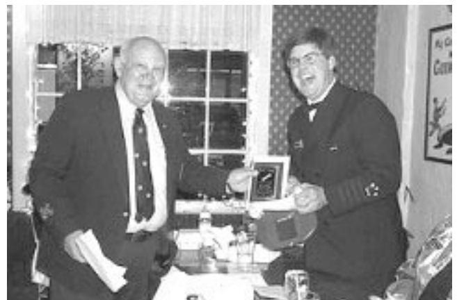
Guess who's getting what here!