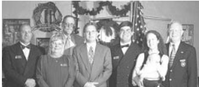
Your New 2001-2002 Bridge