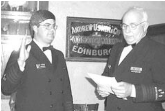
Oath of Office - This makes it official!