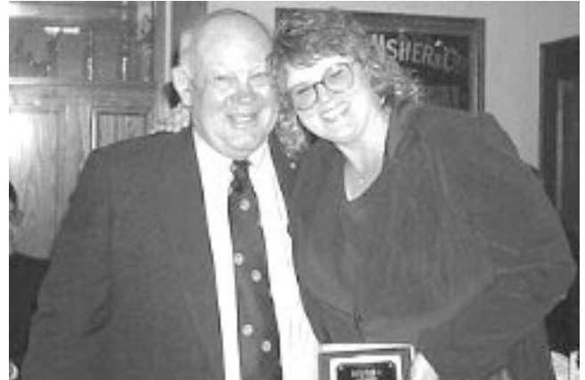
Founders (New) - Boo