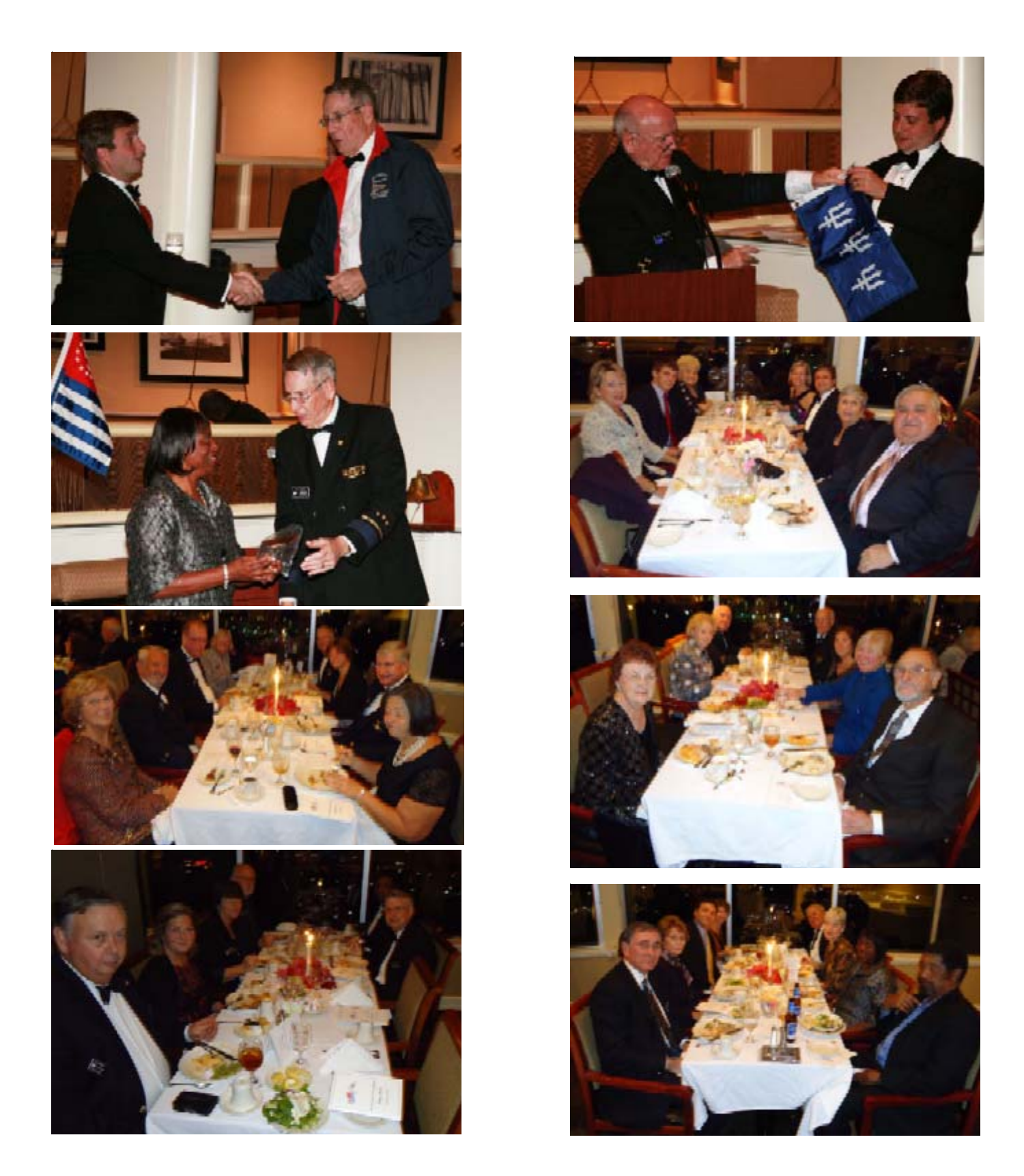
The Palmetto Log, Page 9