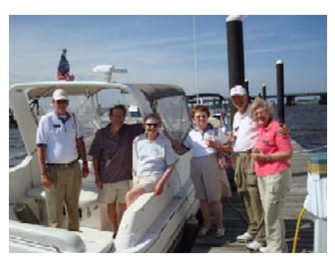
CS&PS members at D26 Rendezvous, boat is Ham & Letters