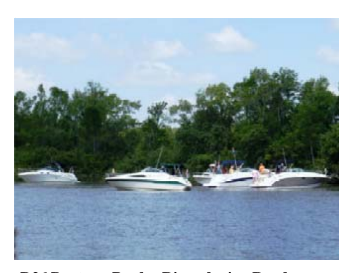
D26 Boats on Peedee River during Rendezvous