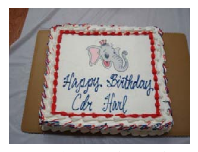
Birthday Cake at May Dinner Meeting