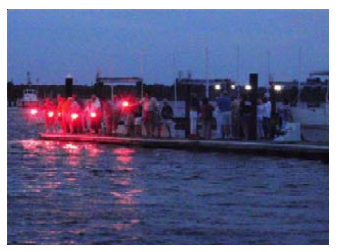
Flare Demo at D26 Rendezvous at Georgetown