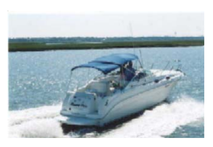
The Palmetto Log, Page 9