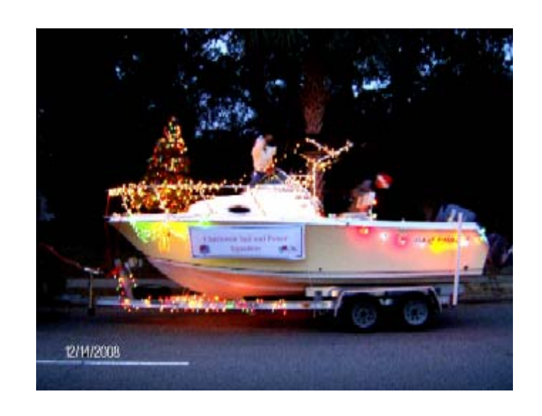
The Palmetto Log, Page 13